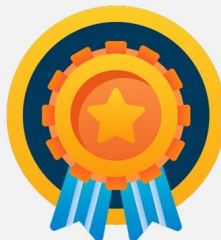
Head of Department