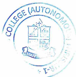
Principal St. Thomas College (Autonomous) Thrissur - 680 001