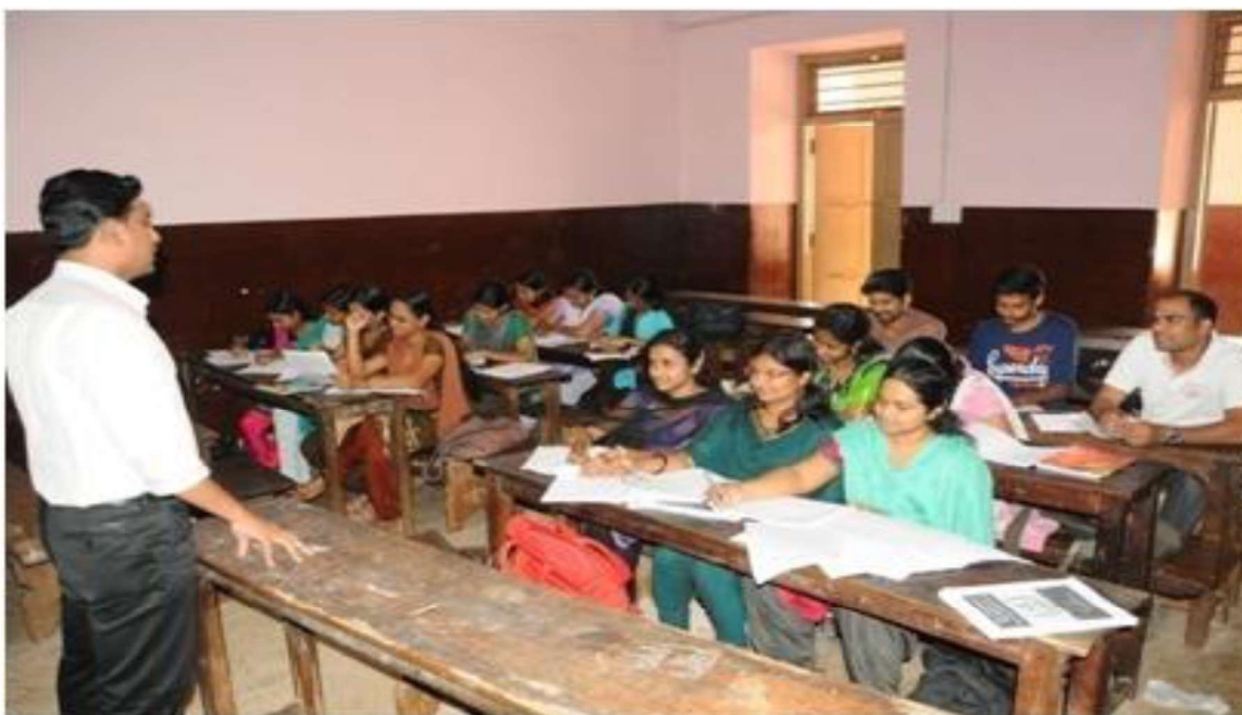
Faculty taking classes; CSIR/UGC NET