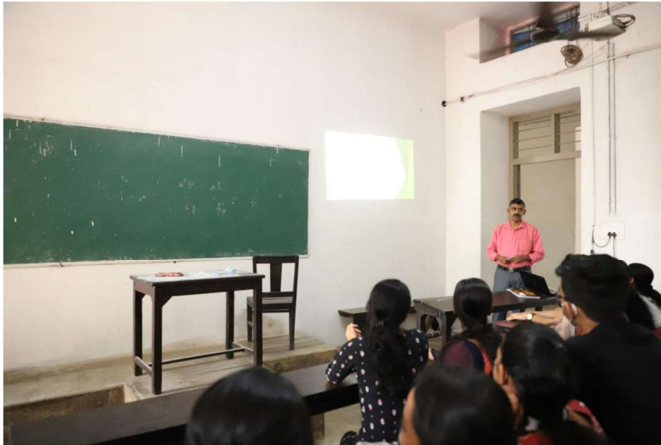
Faculty taking classes- Quantitative Aptitude for Competitive Examinations

Department of Mathematics offers a value added program named ‘Quantitative Aptitude for Competitive Examinations’ which is aimed to make students equipped to face competitive examinations. The course is intended to develop the quantitative aptitude of students for competitive examinations. The course develops the problem solving and logical reasoning ability of students. The students are made to sample questions, thereby the speed of attempting questions is also improved. The course comprises of 60 hrs. 312 students were benefitted by the course.