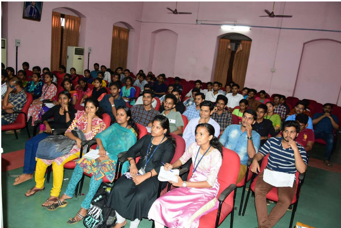
Students attending the Value added course – Flame Up

Career Guidance and Placement Cell of St. Thomas' College (Autonomous), Thrissur organized an online training entitled "Flame Up" in association with TIME, Thrissur for final year UG students. It helped the students to learn more on aptitude skills, quantitative analysis, data analysis, verbal ability and current affairs which made them ready to face any competitive examinations and interviews. The training was conducted in two batches in which batch 1 consists of 135 participants and batch 2 consists of 112 participants. Altogether 247 final year students got the benefit of the event Flame Up.