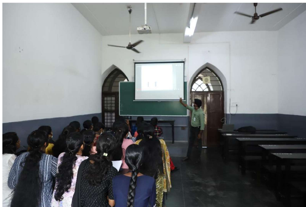
Faculty taking classes; CSIR/UGC NET