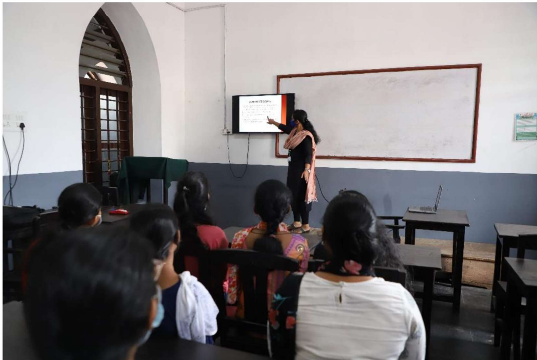
Classes taken by resource person for CAT coaching

The course comprises of 60 hrs. The course include Test series including All India Mock CAT (AIMCAT) intended towards skill development in all areas along with test taking capabilities. The course develops the problem solving and logical reasoning ability of students.