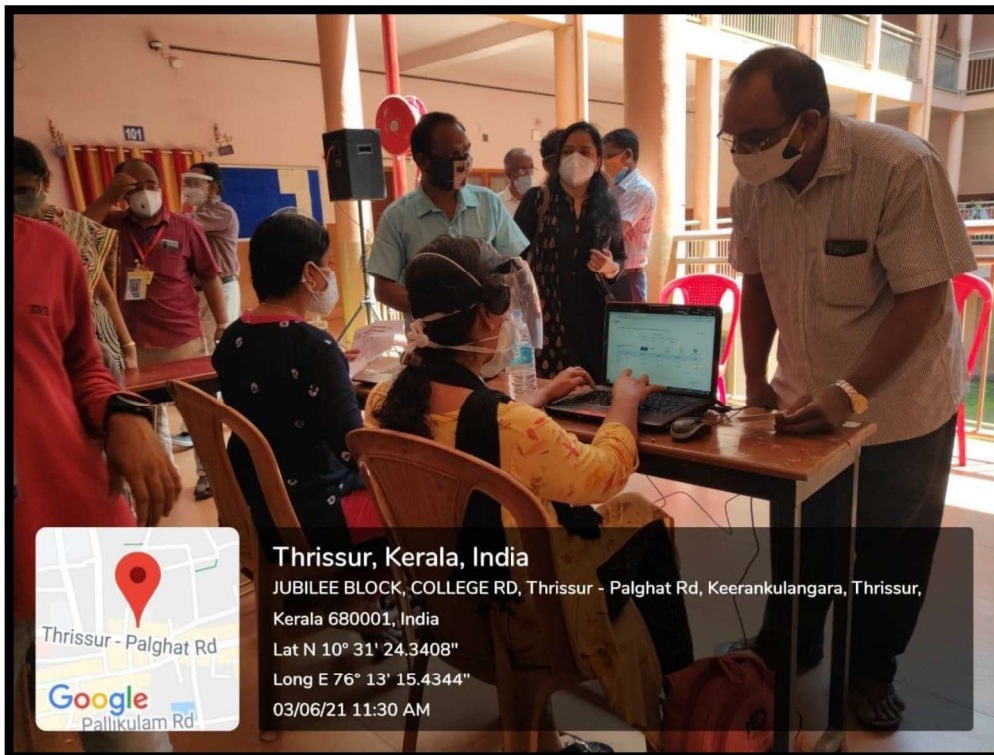
Registration Counter – Vaccination Drive at St. Thomas College