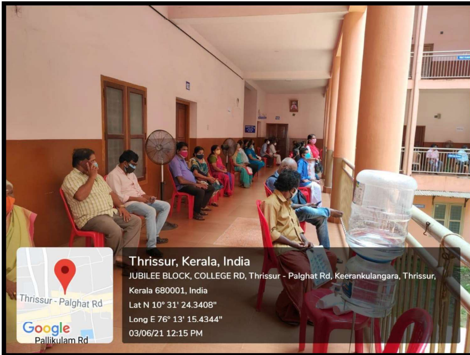
COVID Vaccination Drive at St. Thomas College